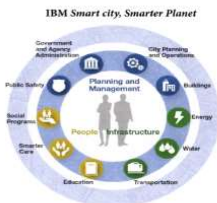
Figure 2. Framework of Smart City

From various perspectives that arise, each region or city will implement it according to the problems, development plans or financial capabilities of the city. Along with the development of Smart City, more and more vendors, researchers and academics are developing Smart City. Several vendors that have developed Smart City include IBM, Alcatel, Siemens, Cisco and so on.