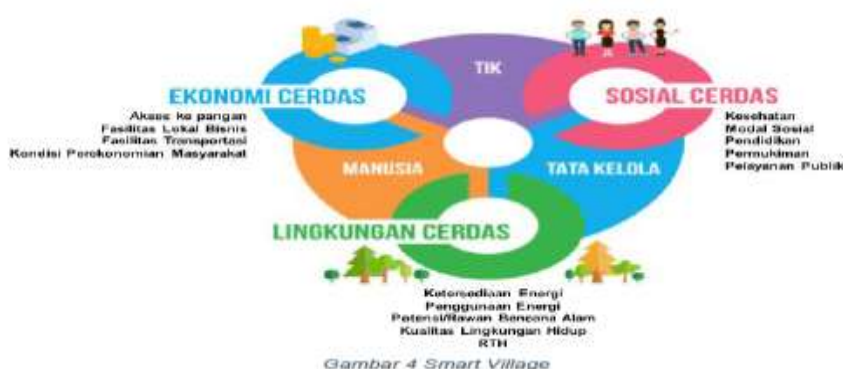
Figure 4. Smart Village

The Smart Village model consists of a. Smart Economy; b. Intelligent Social; c. Smart Environment; d. Information and Communication Technology and Infrastructure; e. Governance and Governance (Governance); and f. Human Resources (People).