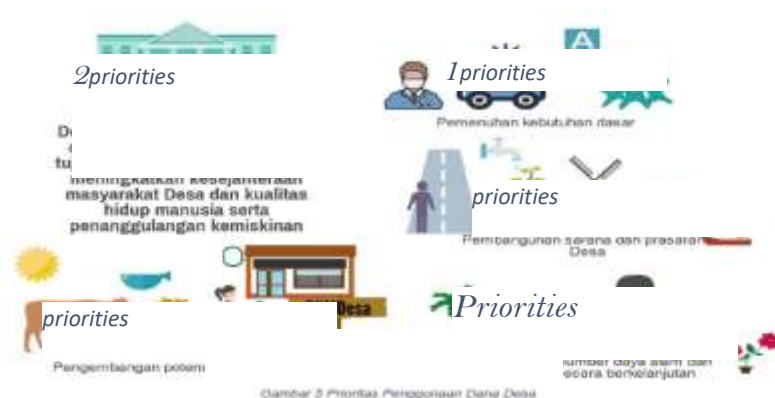
Figure 5. Village Budget Allocation Pories

The success of implementing a Smart Village is highly dependent on "people", or the involvement of villagers in the creation and realization of the Smart Village vision. The Smart Village program will work if there is a good balance between the bottom-up process in which this process involves villagers and adapts them to the required technology. Residents are not only users or connoisseurs of the Smart Village program but also actors who are involved. Citizens can support views of participatory governance. However, participation from citizens will be meaningful if residents have certain capacities and skills. Until the definition of smart people emerged, namely villagers who have the capacity and capability to absorb and utilize appropriate technology to improve the quality of life in the village.