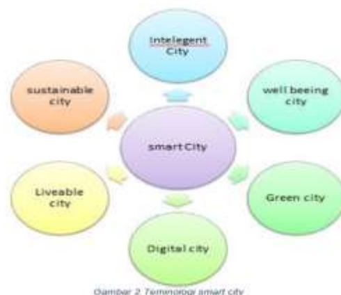
Figure 1. Terminology of Smart City

In detail, it is stated that Smart City is an issue of problem solving and city services through the maximum utilization of Information and Communication Technology (ICT) services according to Manville. Meanwhile, according to Renata Dameri, it is stated that a Smart City is a geographical area, where Information and Communication Technology, logistics, energy production, city management and so on synergize with each other in providing benefits for the community.