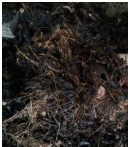
Figure 1. Materials of Compost at the beginning, processing, and end of composting (a and b)

Based on results of the research, the mature compost is well-done at the 37 th day as marked by black compost, odorless, crumb texture, and stable temperature that close to room temperature. Composting has taken place for 40 days, and visually, maturity of the compost can be found out as follow: