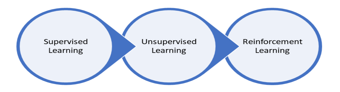
Figure 1. Schematic of classification of machine learning

Machine Learning is classified into supervised, reinforcement learning and unsupervised learning as shown in figure 1.